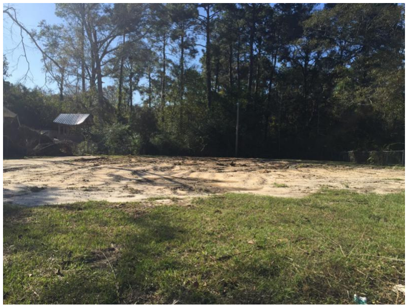
Future home-site for our next Dothan build.

We are getting the plans in place for our Dothan build to begin in the winter! We look forward to partnering with individuals, businesses and churches for volunteers for this build! This will be our third home in the Cloverdale area. Many volunteers have already expressed an interest in working with us. We will post updates on our website and Facebook.